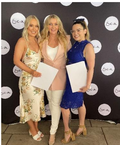
SHB40115 Certificate IV in Beauty Therapy