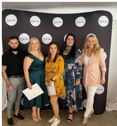
SHB30516 Certificate III in Barbering