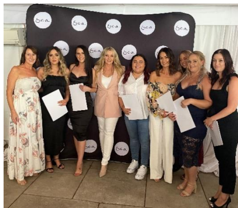
SHB30115 Certificate III in Beauty Services