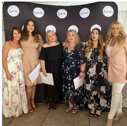
SHB30315 Certificate III Nail Technology