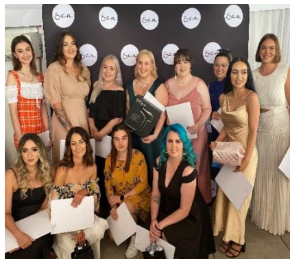
Outstanding achievement recipients