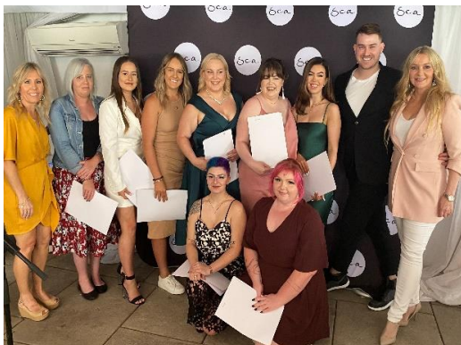
SHB30416 Certificate III in Hairdressing