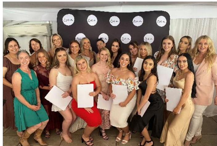
SHB50115 Diploma of Beauty Therapy

It is always a pleasure to present our graduates with the well earned qualifications and meet their family friends who have supported them through their journey. Students who have performed outstandingly throughout the year were recognised with outstanding achievements awards. I am so delighted to report that over 95% of our graduates have been able to obtain work in their chosen fields a job well done to all.