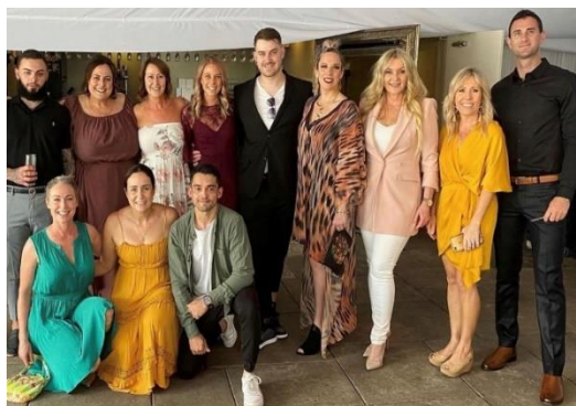
The SCA Team